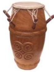
KPANLOGO DRUM SINGLE $270