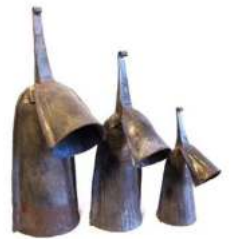
AGOGO SMALL $10 MEDIUM $15 LARGE $20