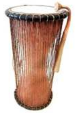
TALKING DRUM SINGLE $100