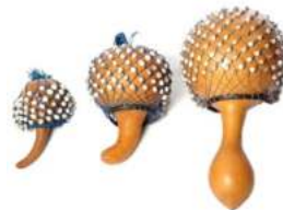
SHEKERE SMALL $10 MEDIUM $15 LARGE $20