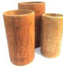
DUN SET SHELLS & RINGS $450 SKINNED $750